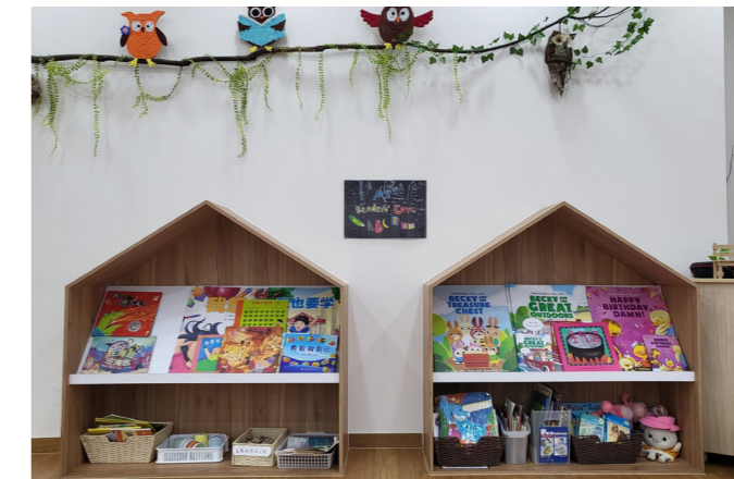
M.Y World @ Woodlands