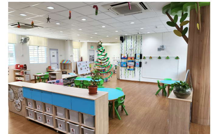
M.Y World @ Yishun Northland