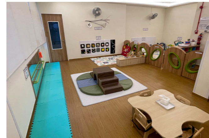
M.Y World @ Tiong Bahru View