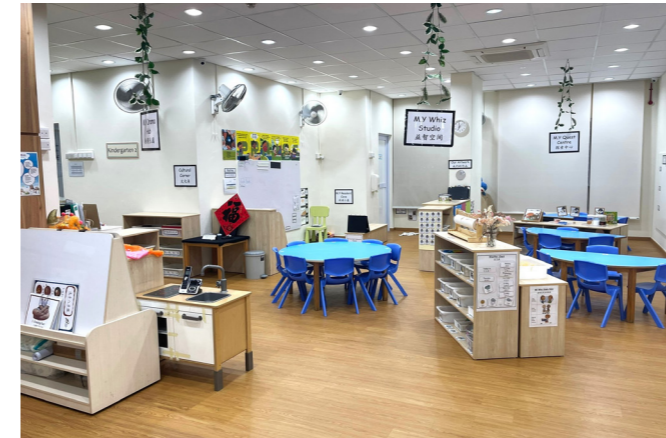
M.Y World @ Admiralty