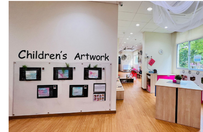
M.Y World @ Hougang DewCourt