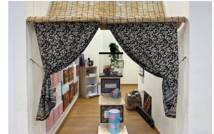
M.Y World @ Teban Gardens