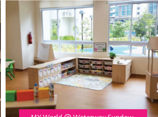
MY World @ Waterway Sundew