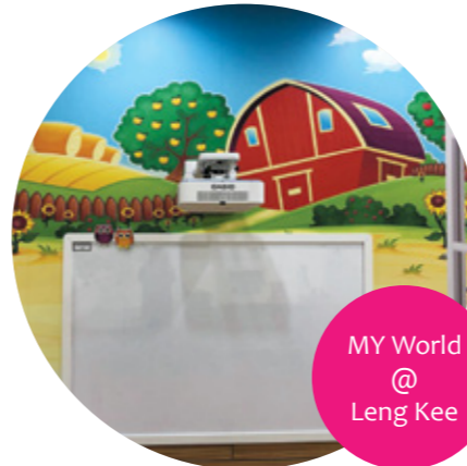
MY World @ Leng Kee

Having been in operation for more than 20 years, MY World @ Leng Kee and MY World @ St George's got its much needed facelift in October 2017. The two centres now have a fully air-conditioned, brighter and more spacious learning space for the children after the refurbishment.