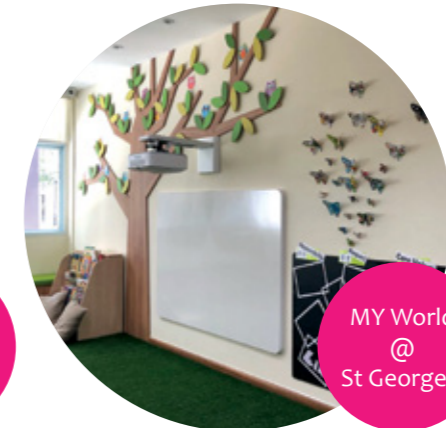
MY World @ St George's