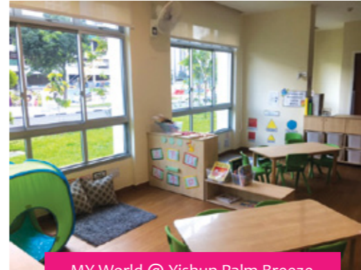
MY World @ Yishun Palm Breeze

Four new centres were opened in 2017 namely, MY World @ Yishun Palm Breeze, MY World @ Waterway Sundew, MY World @ Tenteram Peak and MY World @ McNair Towers.