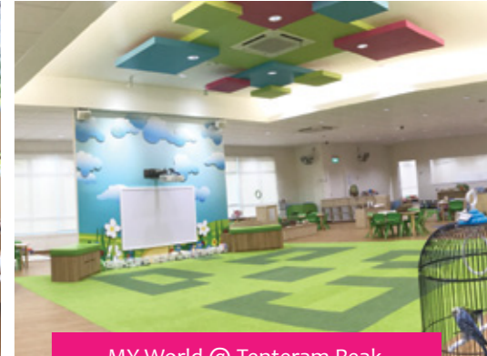
MY World @ Tenteram Peak