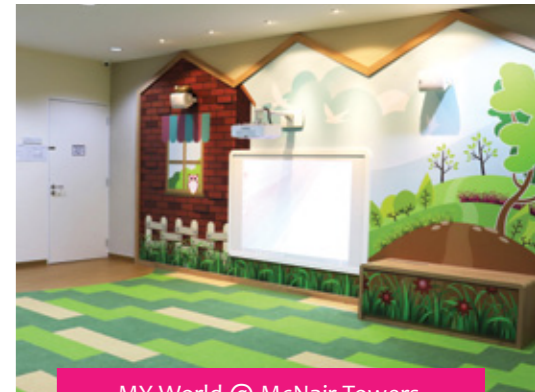
MY World @ McNair Towers